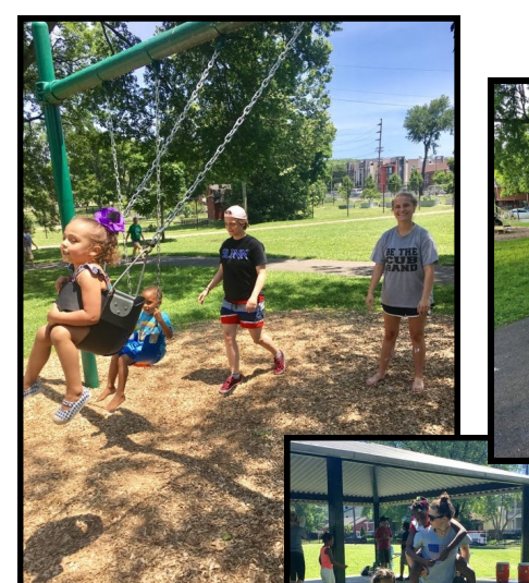
Spending time with the local kids!